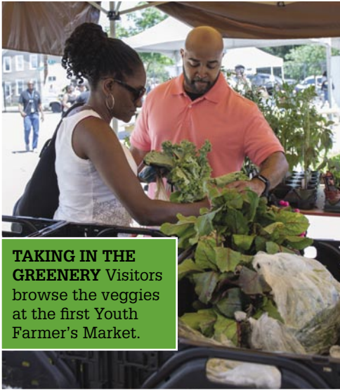
TAKING IN THE GREENERY Visitors browse the veggies at the first Youth Farmer's Market.