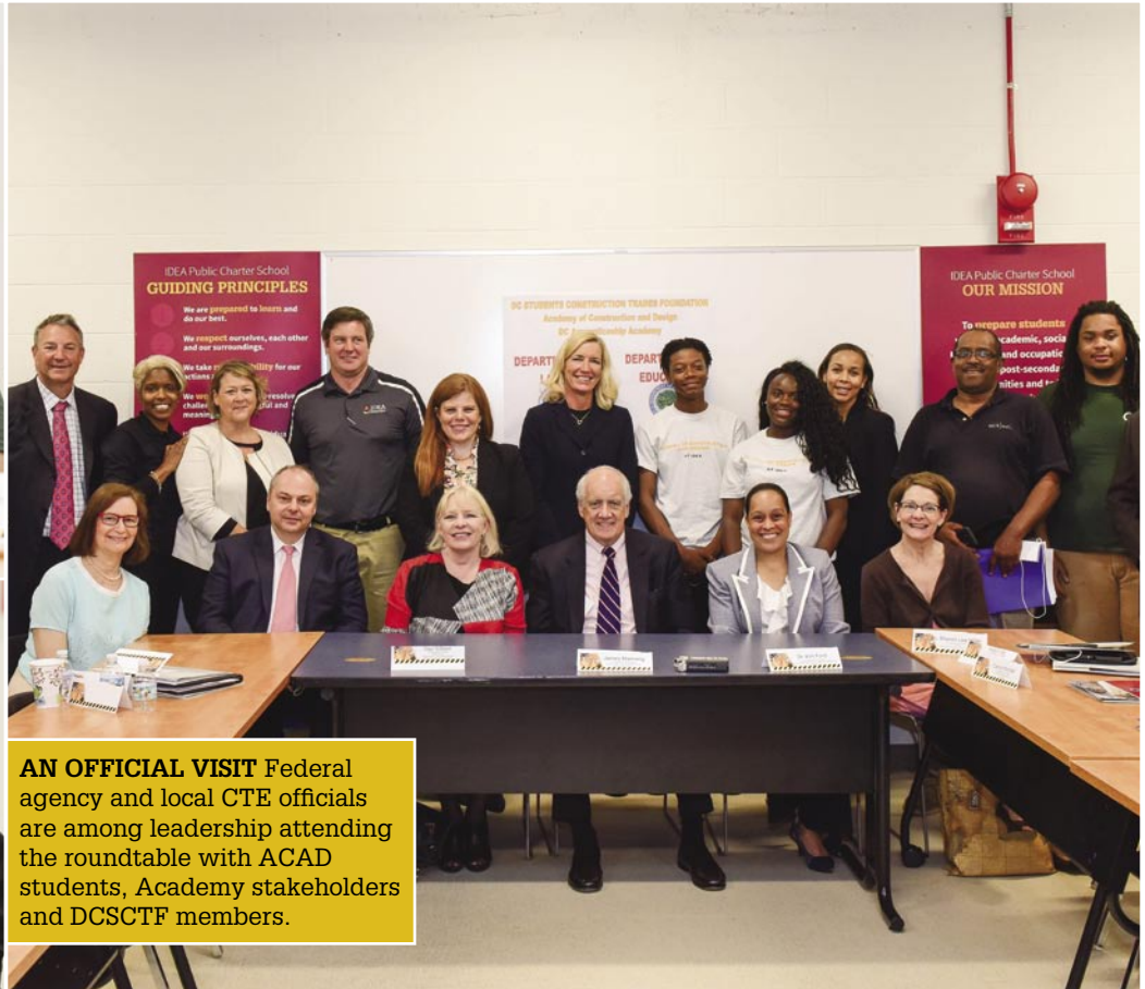
AN OFFICIAL VISIT Federal agency and local CTE officials are among leadership attending the roundtable with ACAD students, Academy stakeholders and DCSCTF members.