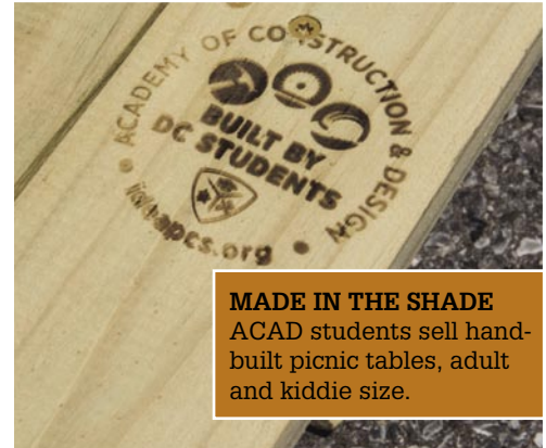
MADE IN THE SHADE ACAD students sell hand-built picnic tables, adult and kiddie size.